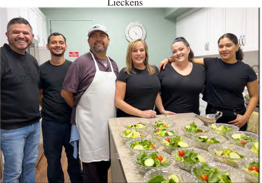
Catering Crew from Country Harvest, Newbury Park